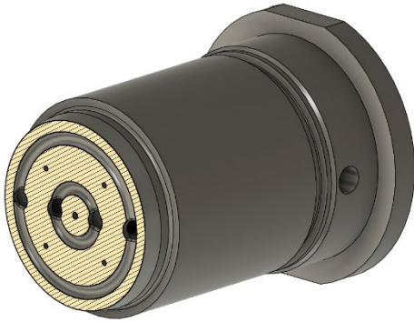
Model showing the two concentric circular conformal cooling channels.