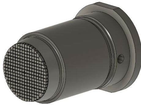
Steel core that forms the part's geometry.